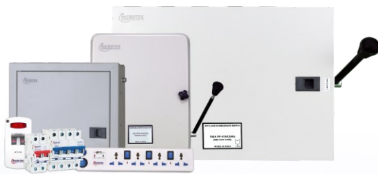
CIRCUIT PROTECTION DEVICES