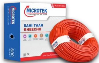
WIRES & CABLES