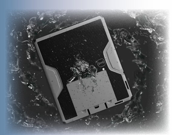
IP68 DUST AND WATER RESISTANCE LUMEN is designed to better withstand the challenges of the emergency room and frequent disinfection