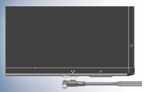
FLEXIBLE CONFIGURATION The same detector may be configured as wireless or tethered. Accessories are common for the LUMEN series