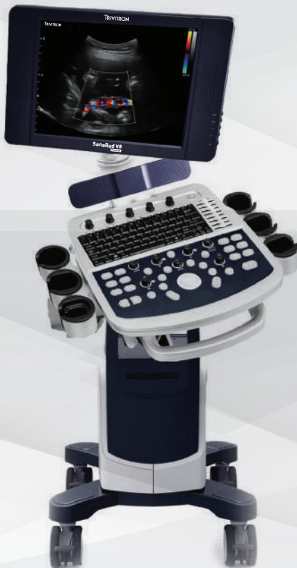
SonoRad V8 Premium