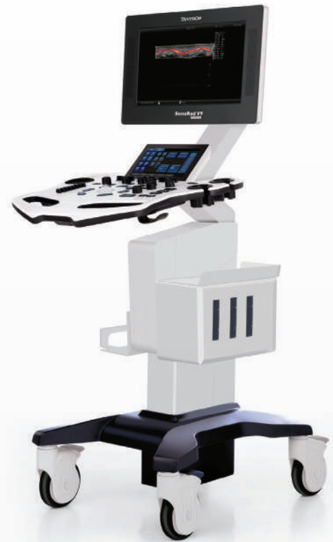
SonoRad V9 Premium