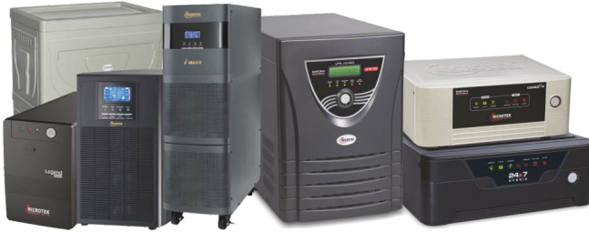
UPS | INVERTERS