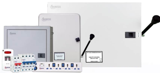
CIRCUIT PROTECTION DEVICES