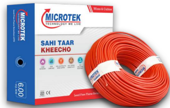
WIRES & CABLES