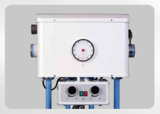
Adjustable collimator with high luminescence lamp for easier & faster positioning