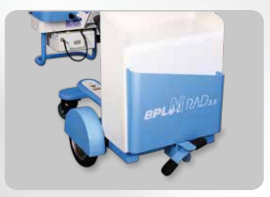
Additional storage space for accessories, notepad etc.

BPL M RAD 3.5 is a high frequency mobile X-Ray solution that combines unique design & superior image quality at low radiation dosage, which is ideal for patient wards, intensive care, operating rooms etc.