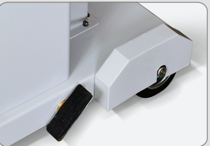
Durable wheels & Efficient Foot Brake mechanism