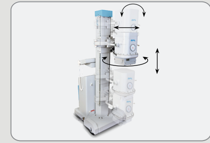
Counter Balanced Tube Head with Vertical, Horizontal, Rotational, Axial & Swivel movements