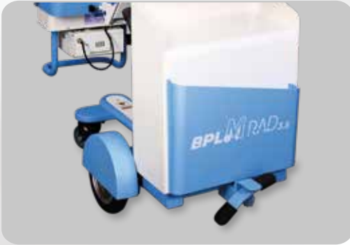
Additional storage space for accessories, notepad etc.

BPL M RAD 3.5 is a high frequency mobile X-Ray solution that combines unique design & superior image quality at low radiation dosage, which is ideal for patient wards, intensive care, operating rooms etc.