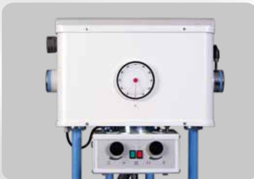
Adjustable collimator with high luminescence lamp for easier & faster positioning