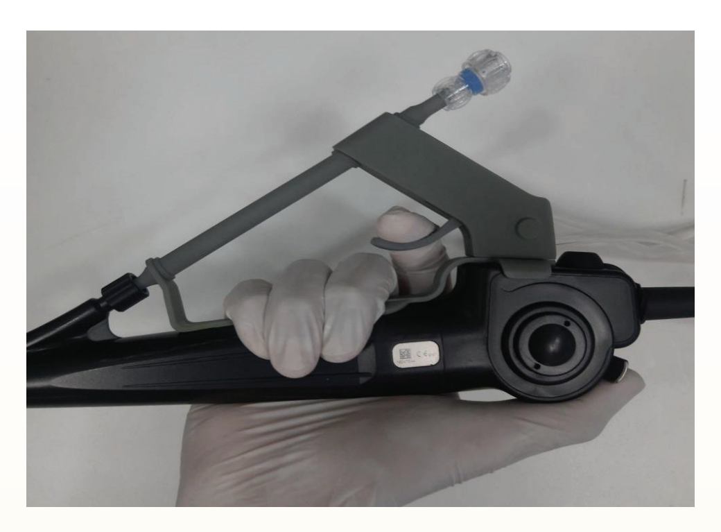
Irrigation Mode (Trigger released) Default Mode