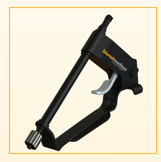
Integrated Scope Connector

The single-use ergonomically designed Integrated Scope Connector (ISC) attaches to single-use 7.5 Fr or 9 Fr Flexible Ureteroscope.