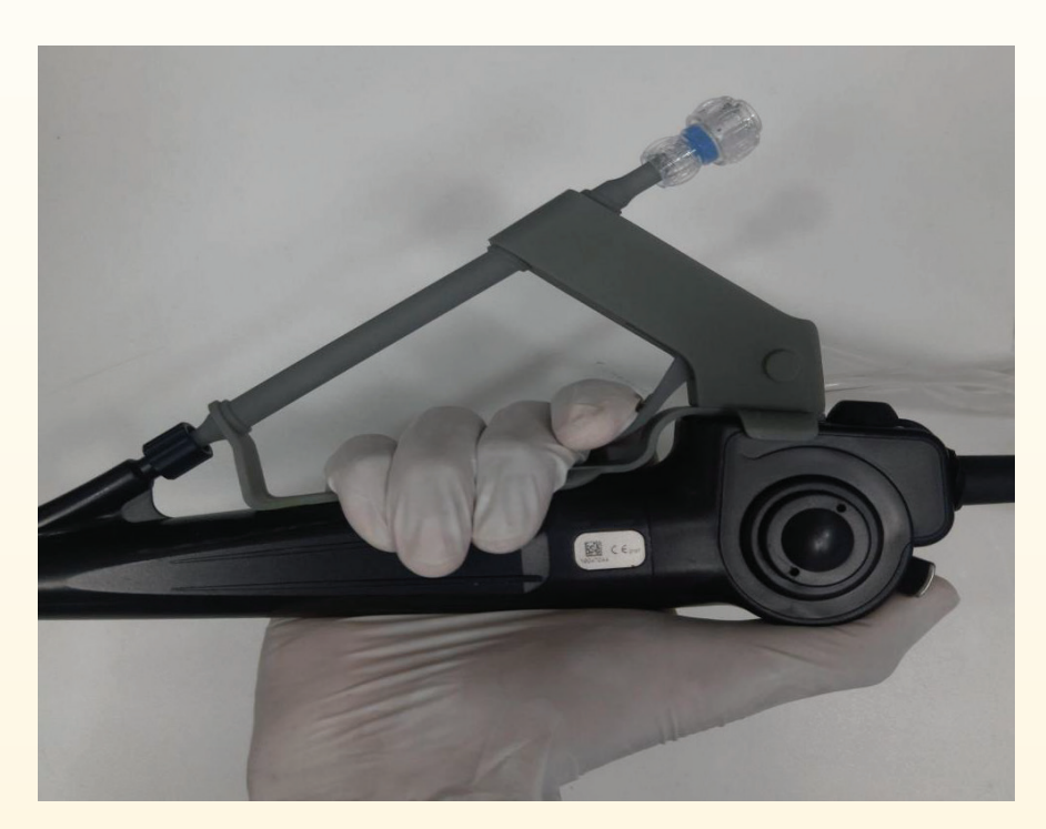
Suction Mode (Trigger pressed)