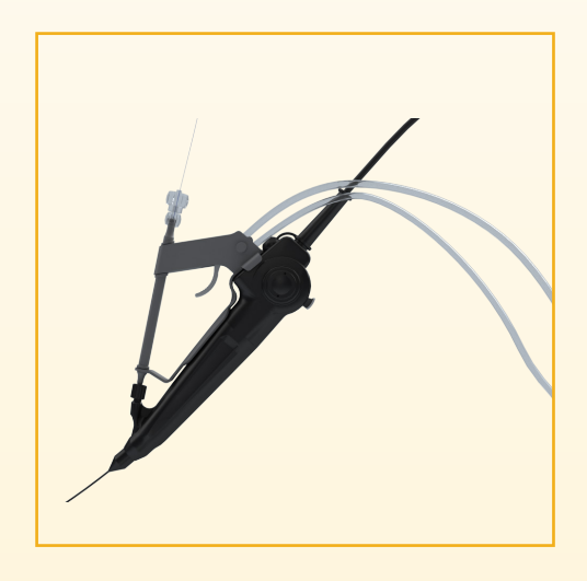
Integrated Scope Connector with Suction and Irrigation Tubing