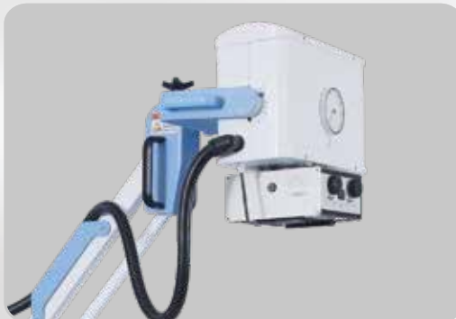
Adjustable collimator with high luminescence lamp for easier & faster positioning