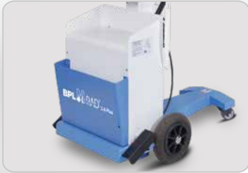
Additional storage space for accessories, notepad etc.

BPL M Rad mobile X-Ray series is an ultra high frequency mobile X-Ray solution that combines unique design & superior image quality at low radiation dosage, which is ideal for patient wards, intensive care, operating rooms etc.