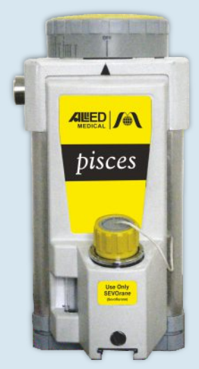
Allied Meditec Pisces