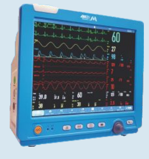
M700 Series Patient Monitors