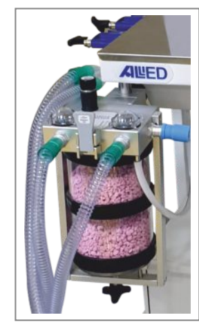
Double Canister Circle Breathing System