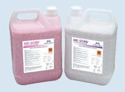
Meditec ME-SORB<sup>™</sup> Sodalime